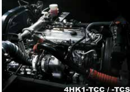
4HK1-TCC / -TCS