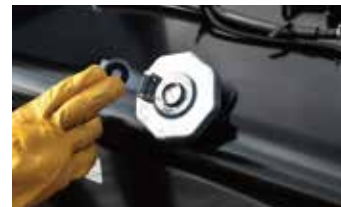
Keyed tank cap