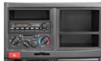
Air conditioning / DIN space