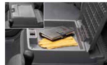
Center console box