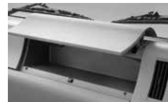
Glove box with lid