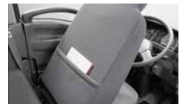
Driver's seat back pocket